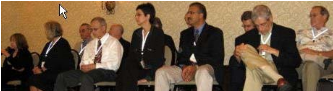
Members of CRN's Scientific Review Board and Medical Advisory Committee participate in the Medical Panel during the July 2007 Family Conference in San Antonio, Texas.